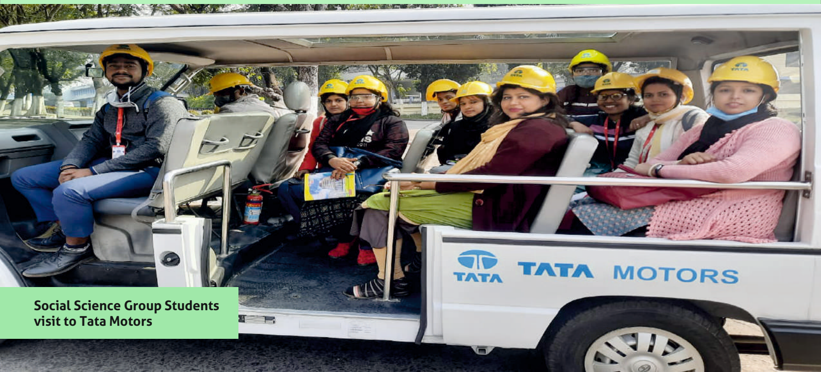
Social Science Group Students visit to Tata Motors

The UGC, New Delhi has awarded CPE (College with Potential for Excellence status to the college under XIth Plan and we look ahead to turn it into a Centre of Excellence in the arena of Higher Education.