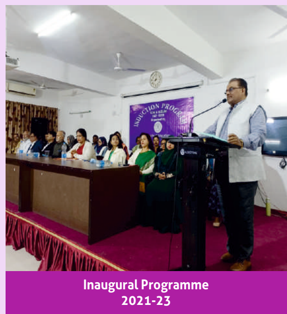
Inaugural Programme 2021-23