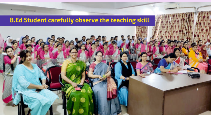
B.Ed Student carefully observe the teaching skill