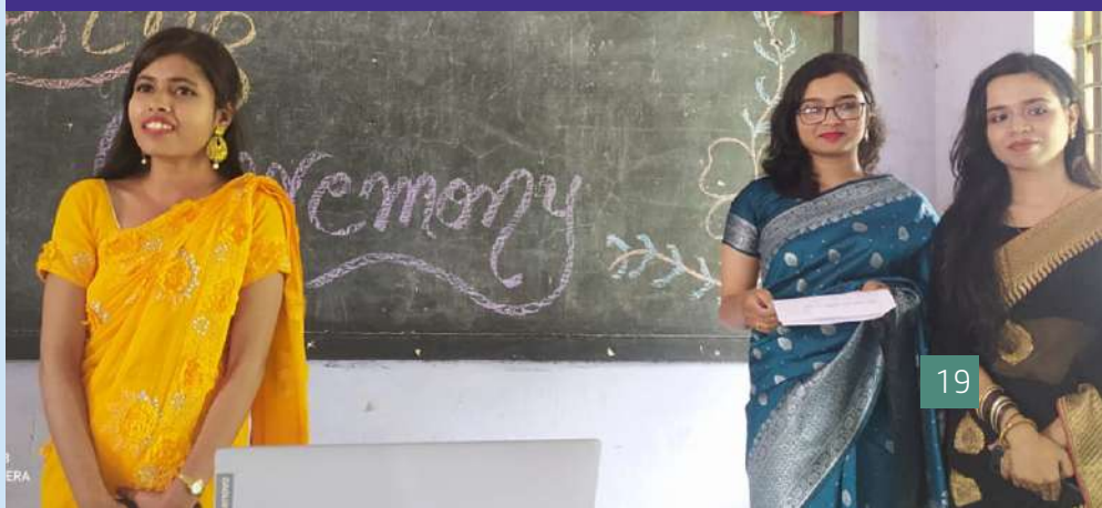
Thanks giving ceremony after Practice Teaching in the school.

Every student is expected to surf the library and utilize it's facilities upto the maximum extent to enrich themselves and update their knowledge and skills.