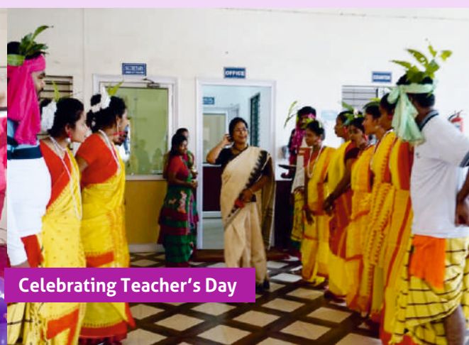
Celebrating Teacher's Day