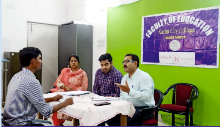
Placement Cell organised walk in Interview

EDUCATION FORUM: For proper channelisation of latent talent in co. curricular activities, the student body will be formed under the guidance of Head.