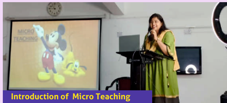
Introduction of Micro Teaching